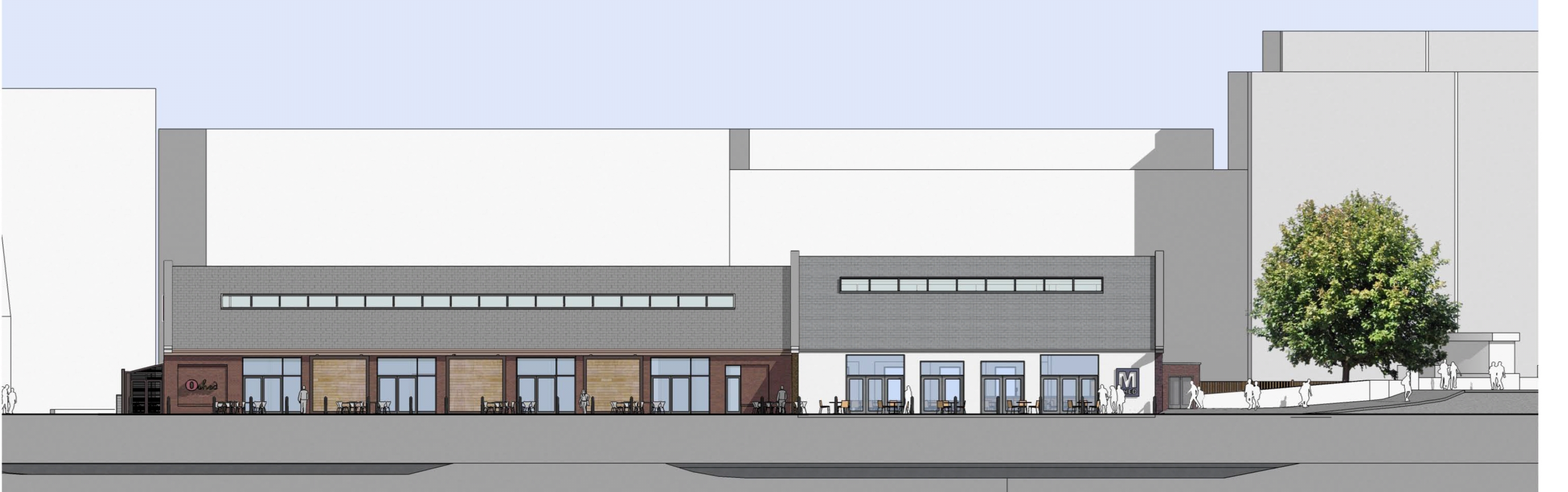
West Elevation (Welshback)